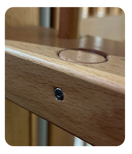
8. tighten the screw until the head is flush with the surface.