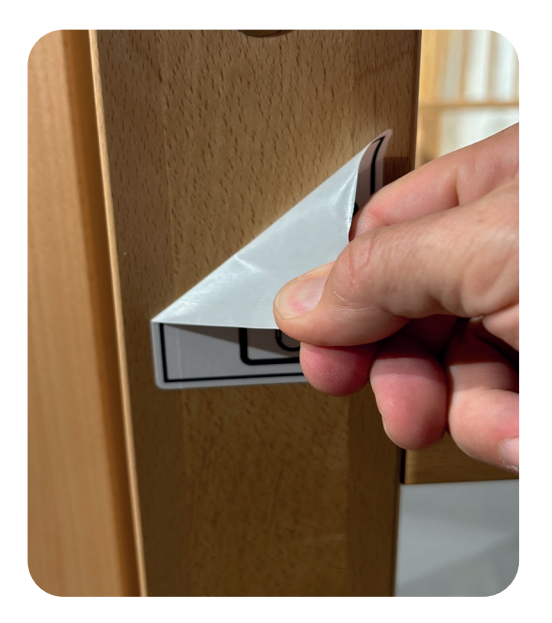
3. Entfernen Sie den Aufkleber vom Pfosten.