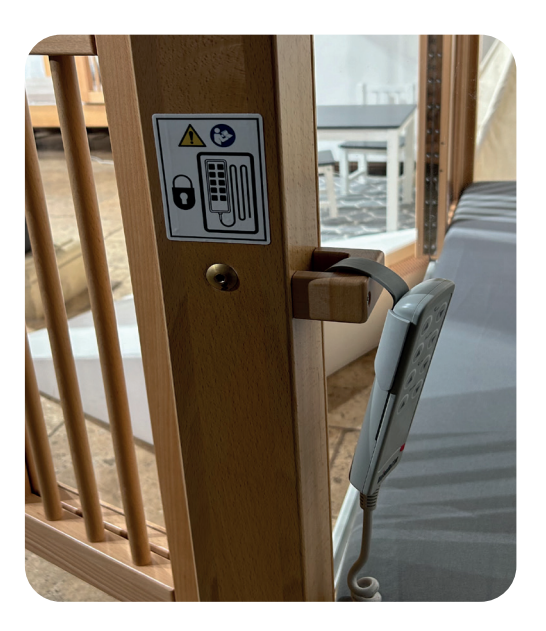
4. Kleben Sie den beiliegenden Aufkleber wie abgebildet an den Pfosten.