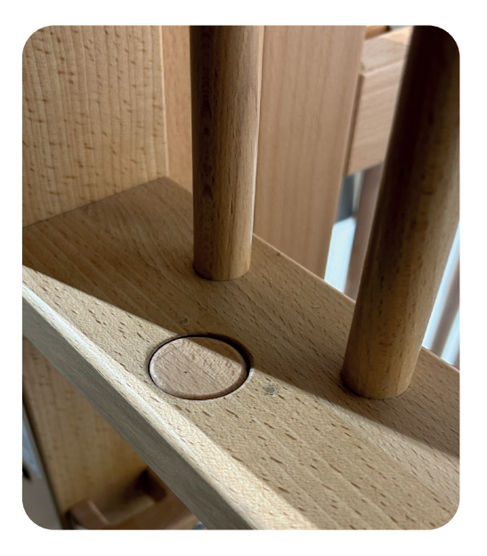
6. Position the wooden plug flush in the opening. Hold it in position if necessary.