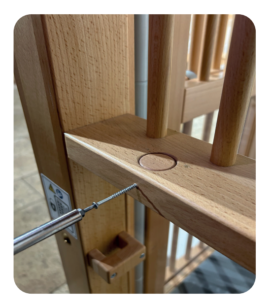
7 Screw the plug in place with the enclosed screws without pre-drilling.