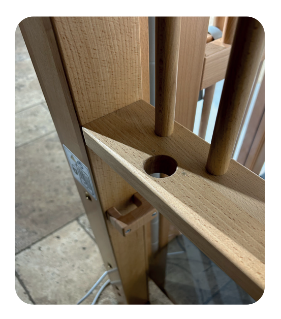
5. Remove the hand control the opening in the side frame.